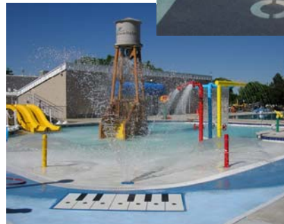
Anderson Park Building and Pool