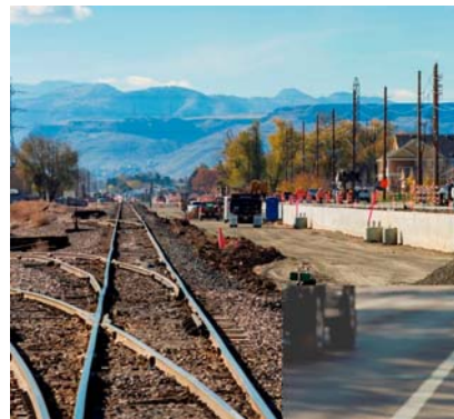
Gold Line Light Rail

Finally, the increased sales and use tax provides funding for the new Ward Road commuter rail station at 53 rd and Ward Road. This location needs new and updated roads, sidewalks, a pedestrian/bike bridge, and a traffic light— completing access and taking full advantage of both the rail line as an economic driver in the northwest corner of the city as well as offering unique access to Denver and Denver International Airport.